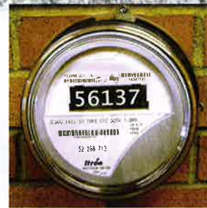
Display? Check breakers and fuses