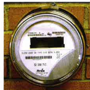
No display? Call WIEC!